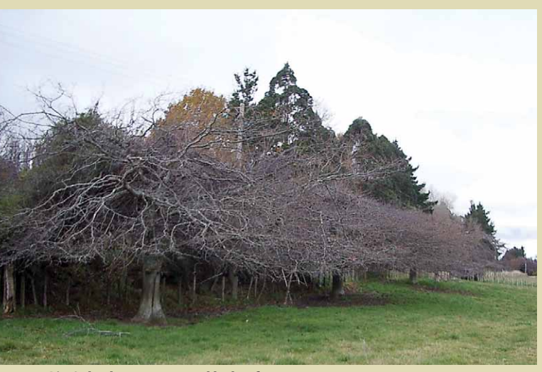
Pin Oaks that were grazed by beef steers.

Many species of oak are grown in New Zealand and cases of acorn poisoning have been reported frequently. Oak, rather than acorn, poisoning is uncommon in NZ. A feature of Pin Oaks is that they have very few acorns. Following is a case report of toxicity in beef cattle grazing pin oak.