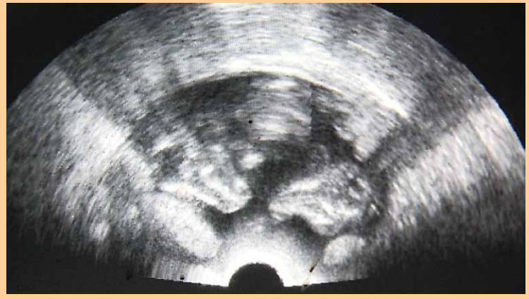
A set of twin lambs- can you spot two heads?

Jump on our website <u>www.vshb.co.nz</u> to book your scanning in for the 2019 season kicking off soon.