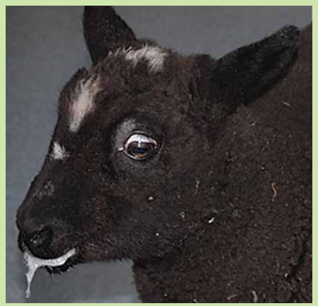
Tetanus in a lamb

To start a vaccination programme all animals require two injections at least four weeks apart. They will then need an annual booster to retain immunity. It is best to vaccinate ewes