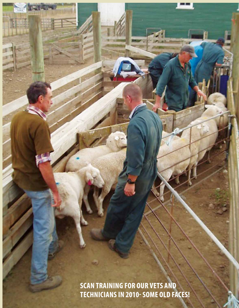
SCAN TRAINING FOR OUR VETS AND TECHNICIANS IN 2010- SOME OLD FACES!