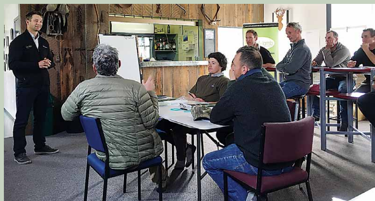
Workshop at Waiwhare in Hastings

The workshops are very interactive and are devoid of any powerpoint slides! Most of the 4-5 hours is spent working in small groups figuring out the various intricacies of internal parasite management and the risks of creating drench resistance on your farm. Most farmers come away from the workshops with a great understanding of worm control and a renewed enthusiasm for sustainable parasite control. If you are interested in attending a workshop contact your local B+LNZ extension manager and ask them when the next one is. For more info on Wormwise go to http://wormwise.co.nz/